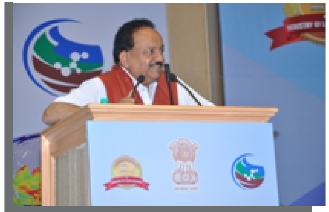
The Hon'ble Union Minister for Science & Technology and Earth Sciences, Dr. Harsh Vardhan