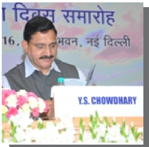
The Hon'ble Minister of State for Science & Technology and Earth Sciences, Shri Y.S.Chowdary