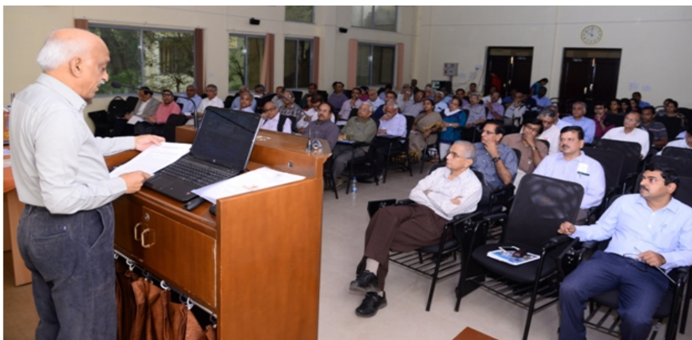
Shri. A.S. Kiran Kumar, Secretary, Department of Space (DoS) and Chairman, ISRO addressing the gathering.

Shri. Kiran Kumar went on to talk about the various satellites and tools developed by ISRO and how they help in getting the data on climate and other parameters. He also spoke about the new generation satellites that are going to be launched by ISRO in future and how it can help with this initiative.