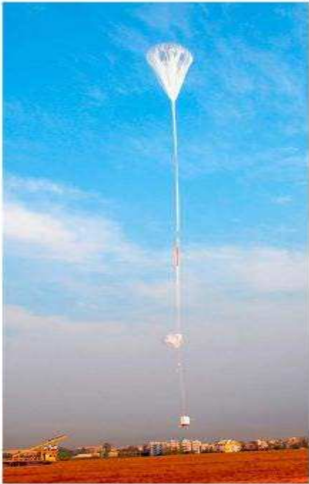
Figure 1: High altitude balloon facility used for the measurement of soot

Soot is one of the primary air pollutants which absorbs the sunlight and consequently warms the atmosphere. In most parts of India we find a high concentration of soot near the ground on account firewood used for cooking and emissions from vehicles and coal power plants. Measurements of the altitude profiles of BC over Central Indian location, Hyderabad, using high-altitude balloon ascents, have shown occurrence